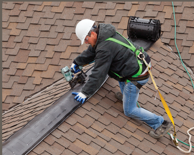
Xtractor Vent XLP Turbo